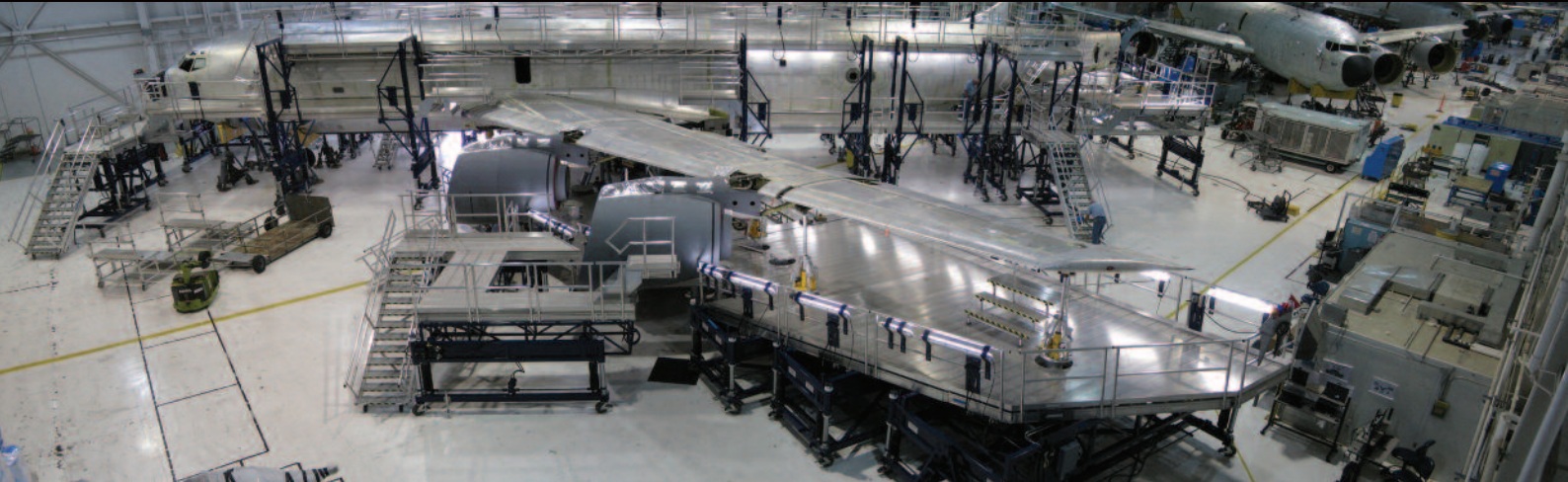
CUSTOM ACCESS SOLUTIONS

Maintenance Platforms and Docking Systems